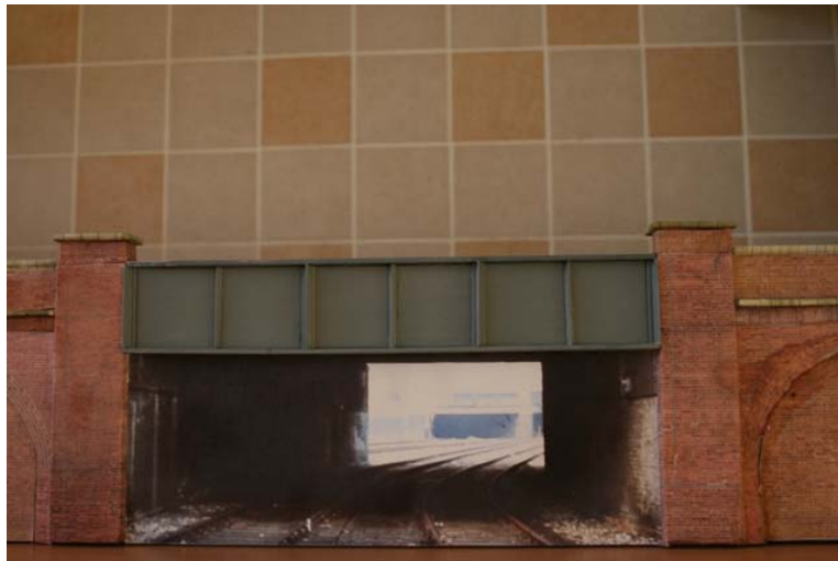
Home made girder bridge over " a real railway"

I then remembered I had a photo of the approach to St Pancras Goods Depot under the North London Line with the St Pancras mainline beyond, taken in 1975 when I was with Camden Council and involved in buying the land from BR. The proportions of the photo matched exactly the width/height ratio of the gap under the plate girder so the printed photo was then pasted in. I am very pleased with the effect and reminds me of days long ago and now, a vanished scene.