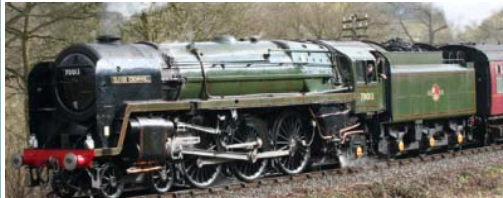
70013 Oliver Cromwell