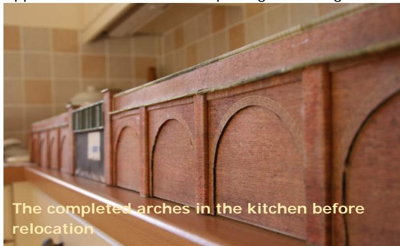
The completed arches in the kitchen before relocation

Once I had mass produced the various parts, the arches, parapet walls, buttresses, copings and ledges, assembly was rapid. I have added my own modification to stick to the prototype of Shrewsbury Station. Until 1985 there was a branch into a Goods yard opposite the station under a plate girder bridge.