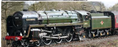
70013 Oliver Cromwell