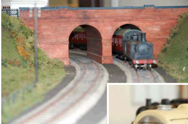
Some photos from the SVMRC Exhibition