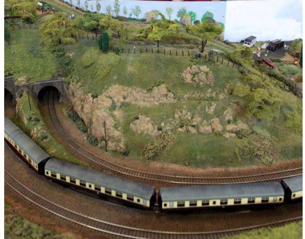
This is a photo taken by the Chronicle and Echo who visited our exhibition. It shows all the committee members plus the chap in the bright red shirt who had come all the way from Australia (not just to see us of course).