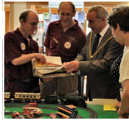
[above] Emerald Night Lego layout. [left] The mayor in discussion about the layout