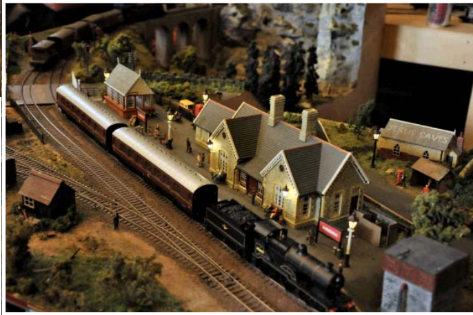
[above & left] Two views of Amberdale