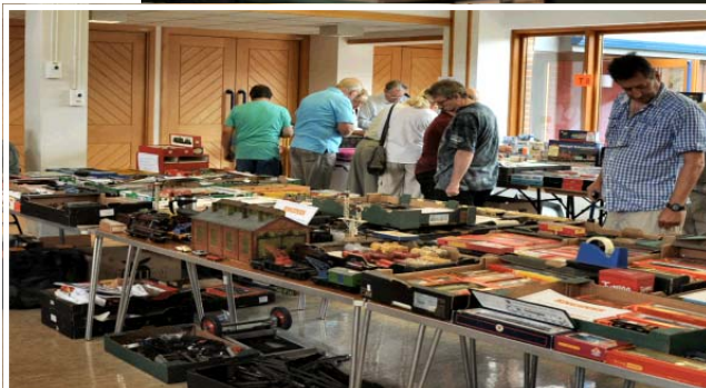
[above & left] Two general views