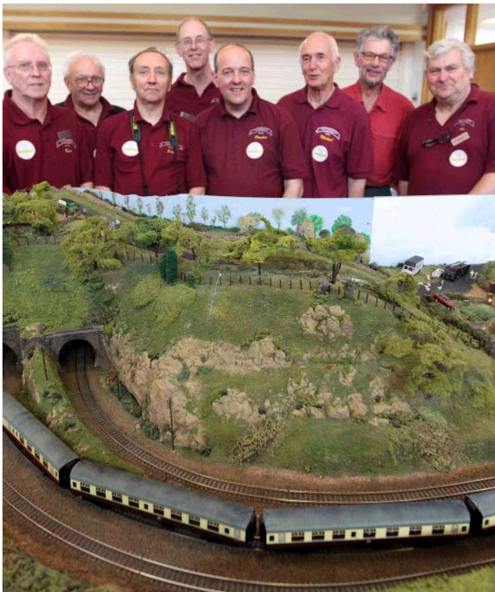
This is a photo taken by the Chronicle and Echo who visited our exhibition. It shows all the committee members plus the chap in the bright red shirt who had come all the way from Australia (not just to see us of course). [photo courtesy Northampton Chronicle & Echo]