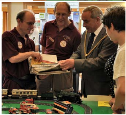
[above] Emerald Night Lego layout. [left] The mayor in discussion about the layout