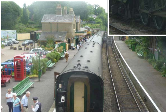
Left—A general view of Alresford station.