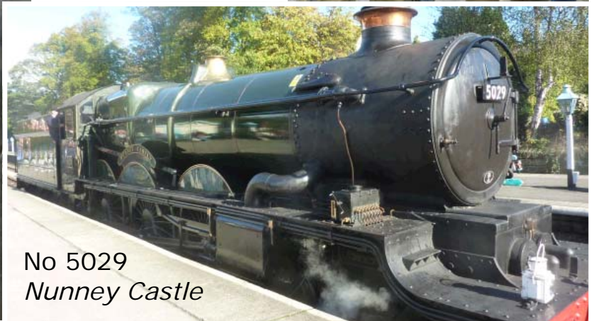
No 5029 Nunney Castle