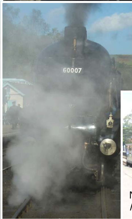
Left—Loco no 60007 Sir Nigel Gresley awaits departure.

Former LNER loco 0-8-0 no 63395 arrives. Who is the man on the platform wearing the trilby and attaché case, carrying the camera? A spy may be? A member of the Gestapo?