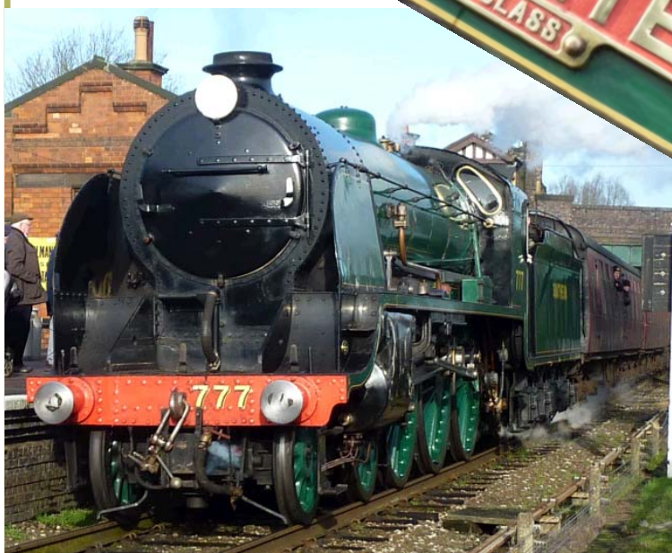
This page—Former Southern region locomotive No 777 Sir Lamiel at Woodhouse & Quorn station.