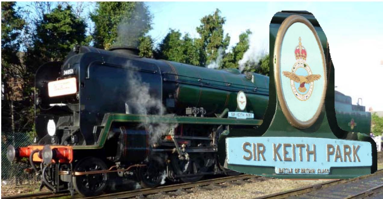
[above] Battle of Britain class no 34053 Sir Keith Park.