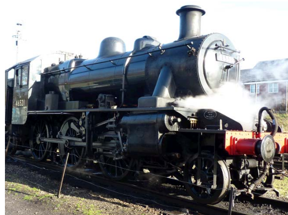
[right] ex LMS Ivatt Class 2 2-6-0.