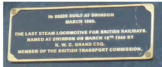
No 92220 Evening Star.