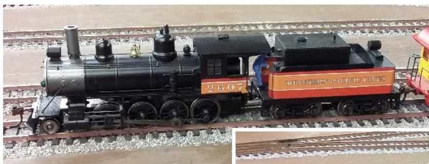
This American loco had sound fitted.