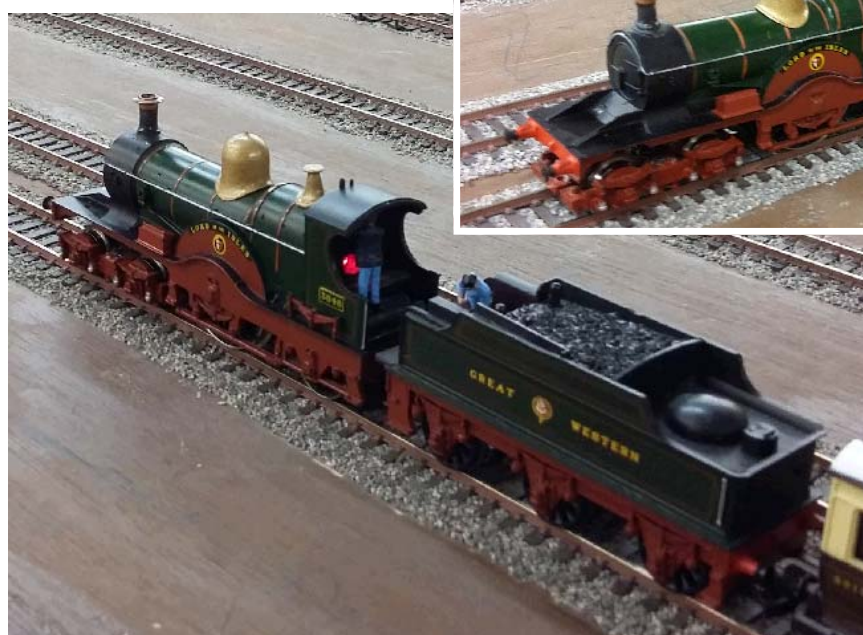
No 3048 Lord of the Isles has sound fitted plus a glowing fire box and a smoke unit.