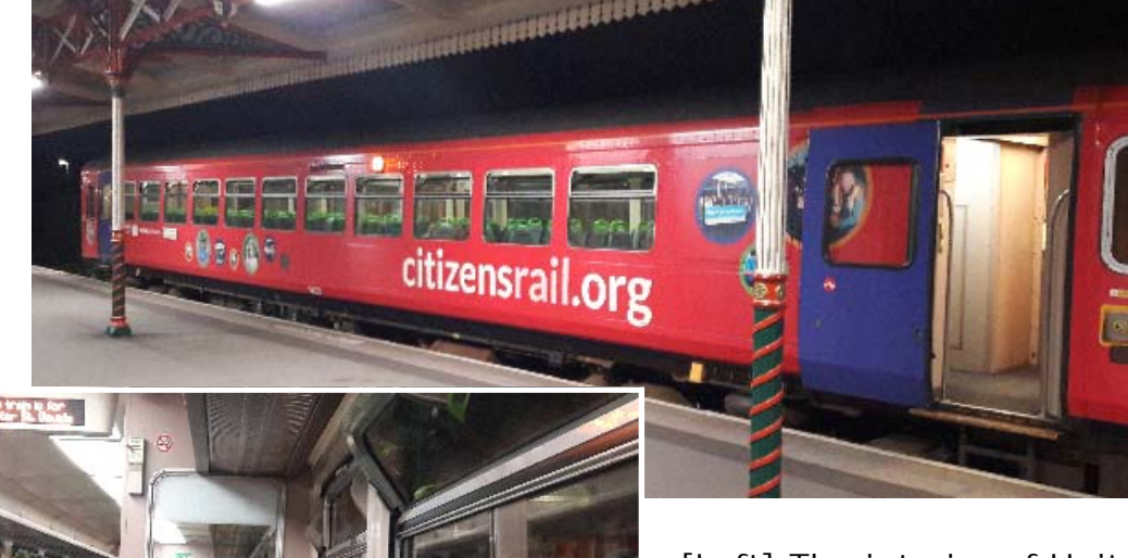
[Left] The interior of Unit 153 325 whilst at Paignton on 16th July 2017.

In the summer of 2011, two London Midland Class 153s, 153325 and 153333 were allocated to the South West for strengthening purposes, based at Exeter (EZ) depot for the duration. This allocation was eventually made permanent.