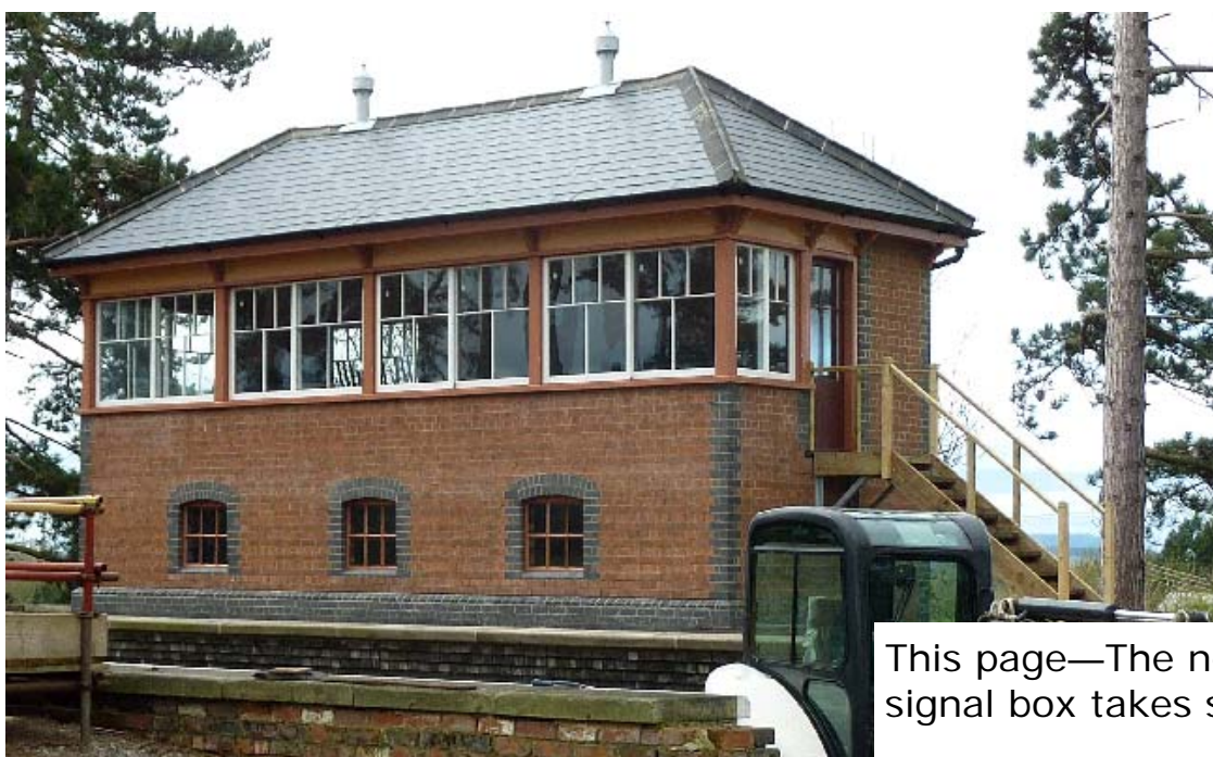
This page—The new signal box takes shape