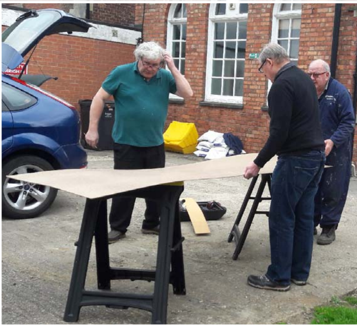
Next job was to line the floor with hardboard. Here the sheets of hardboard are cut to size.