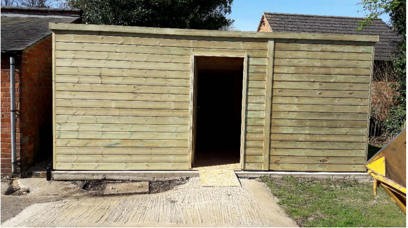
Our store room is built.