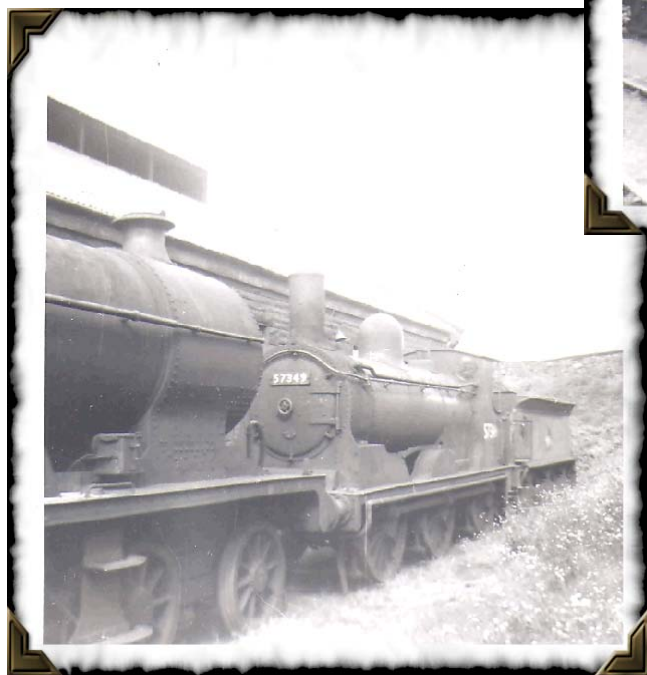
Above—Carlisle Kingmoor MPD with Caledonian 0-6-0T No 56332 on 31-7-59