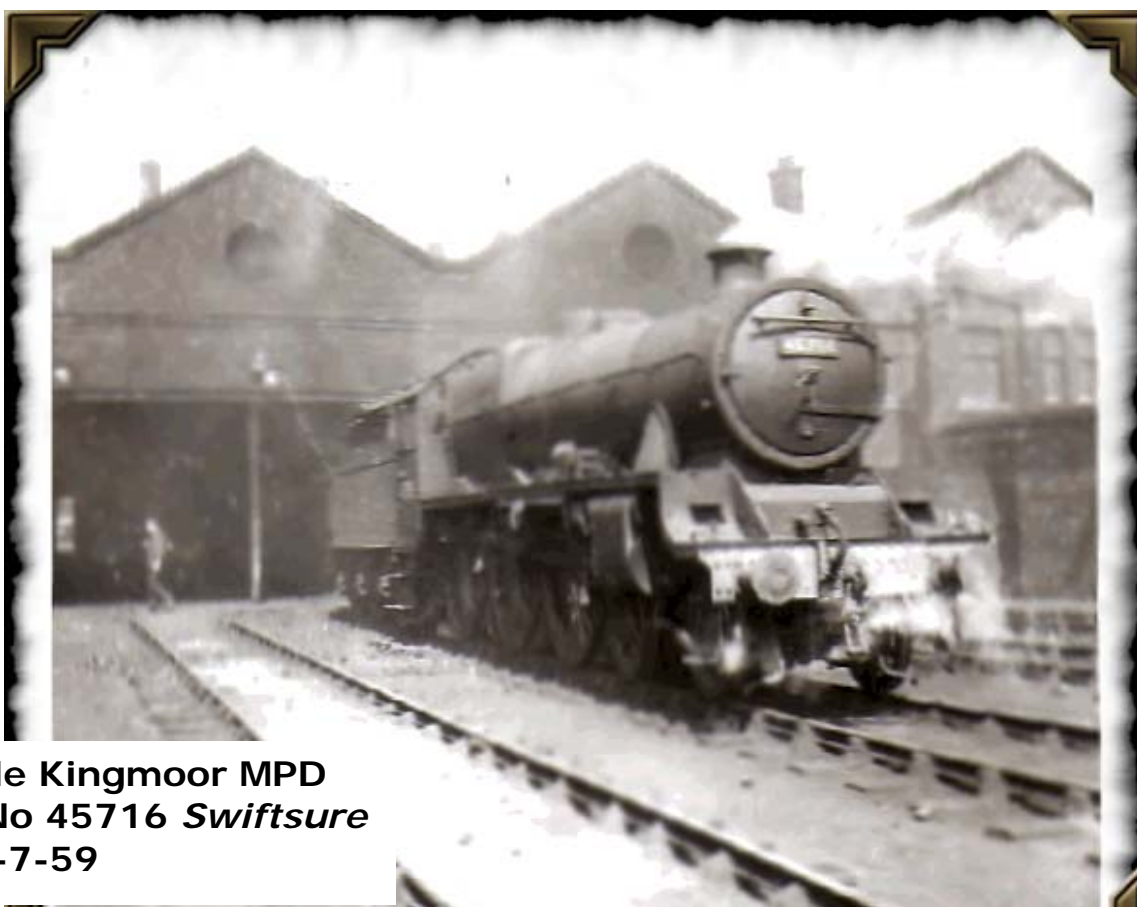
Carlisle Kingmoor MPD with No 45716 Swiftsure on 31-7-59