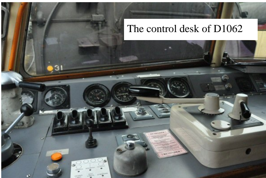
The control desk of D1062