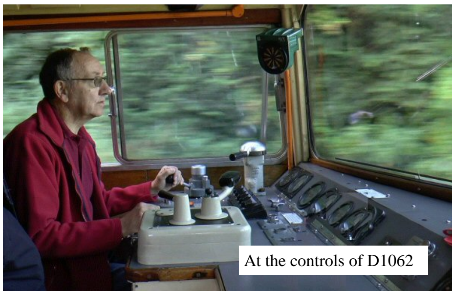
At the controls of D1062