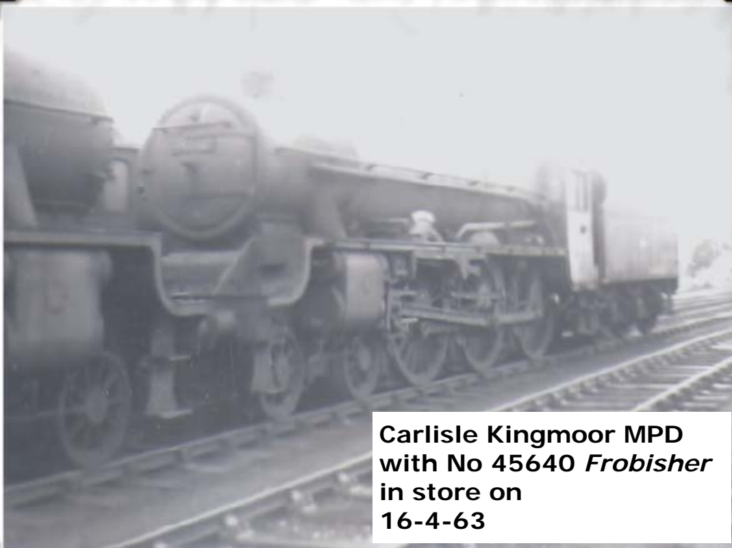
Carlisle Kingmoor MPD with No 45640 Frobisher in store on 16-4-63