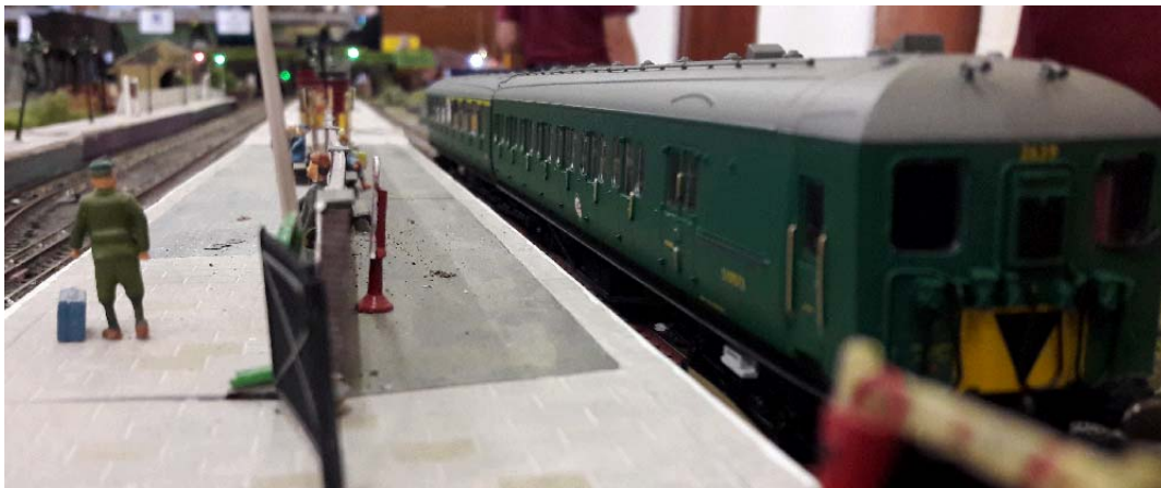
[centre] A 2 car electric unit waits at Greenford