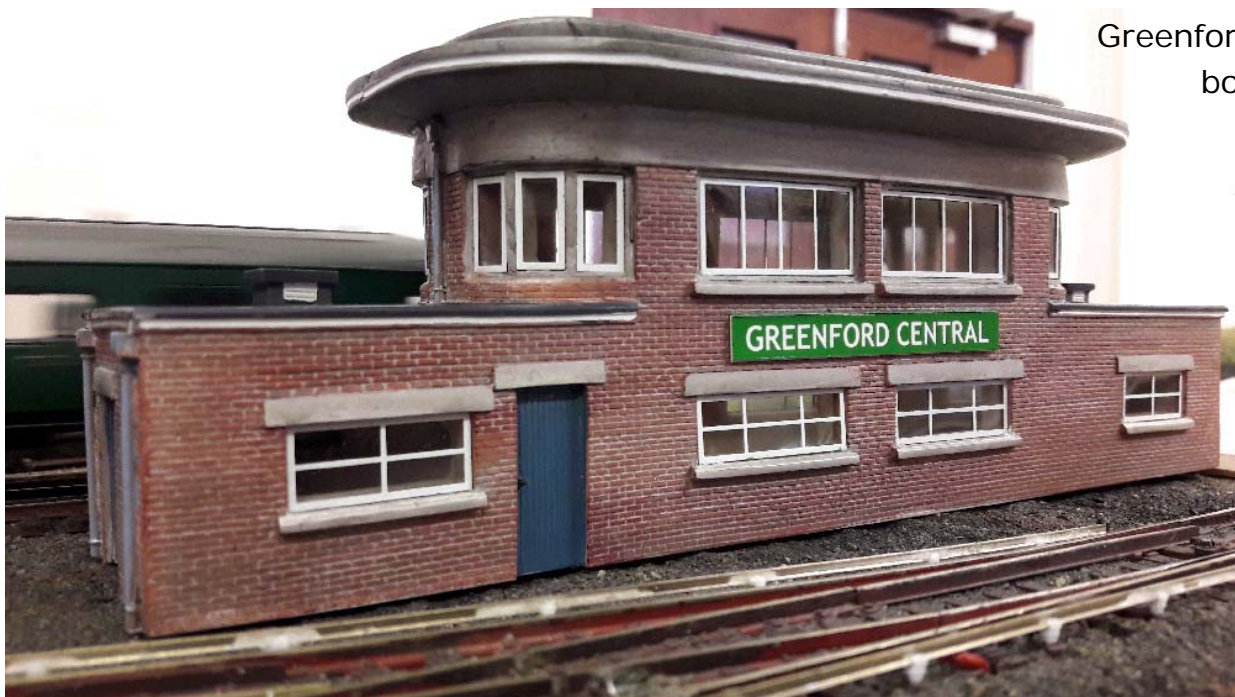
[below] Greenford signal box