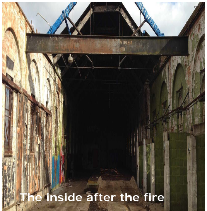
The inside after the fire

Lets hope we can get a look round when the work is finished.