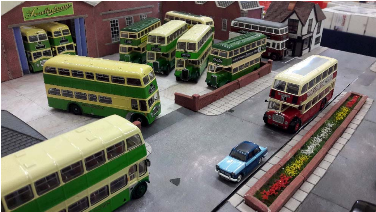
[above] Greenford bus station