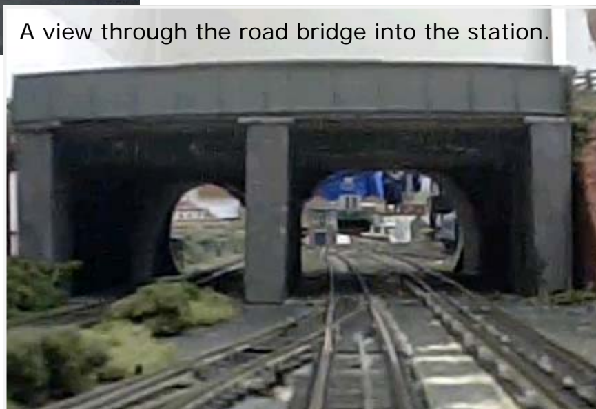
A view through the road bridge into the station.

Diesel hydraulic power at Greenford. Amazingly its not mine. Someone else with good taste!