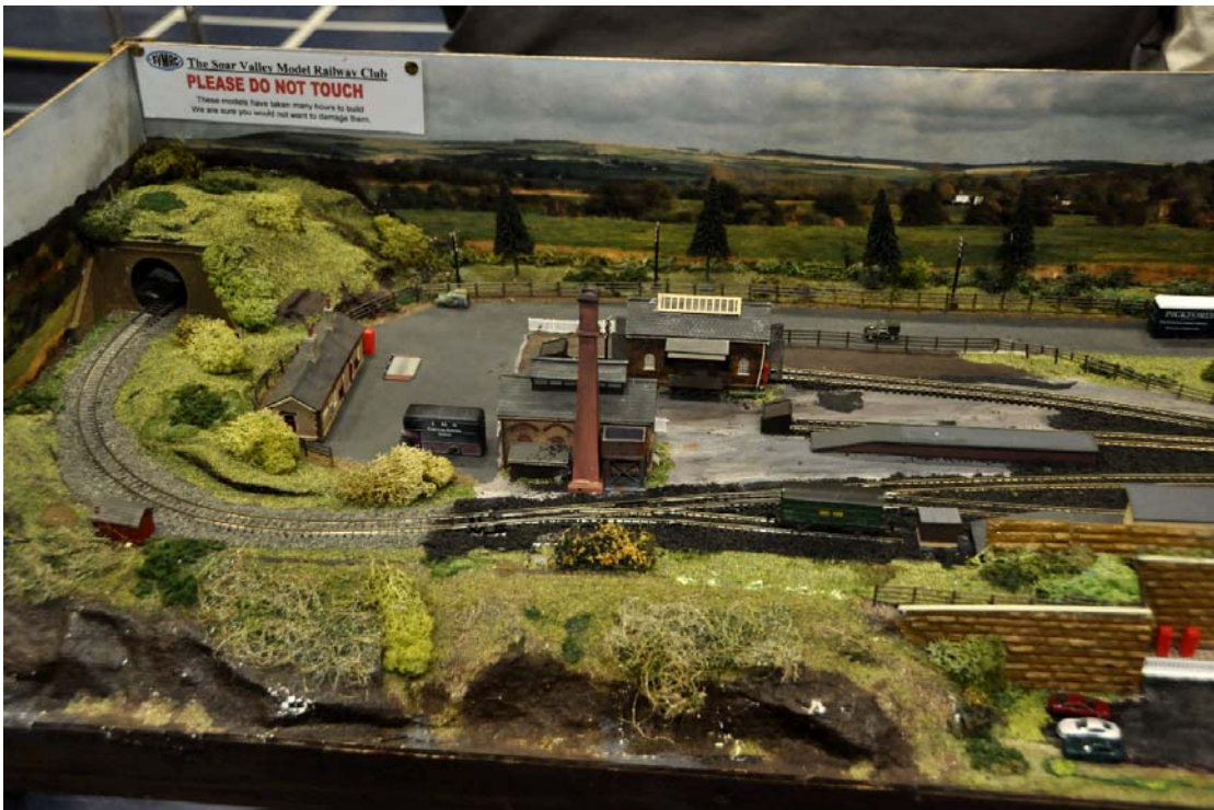
Two photos of Jimmys End