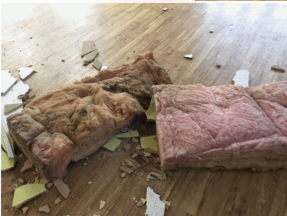
Some photos of the problem.