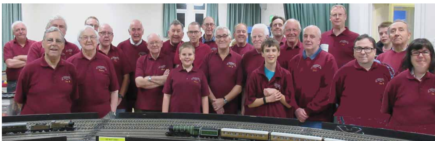
The group photo taken around the Test Track recently—in old regalia.