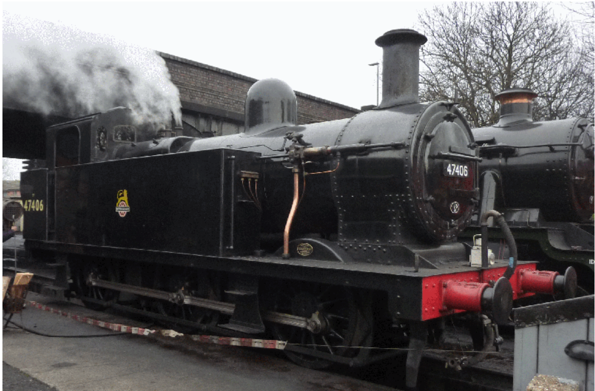
[above] LMS 0-6-0 Jinty

[below left] LMS designed 8F 2-8-0 no 48624. This is a wartime example being built at Ashford in 1943.