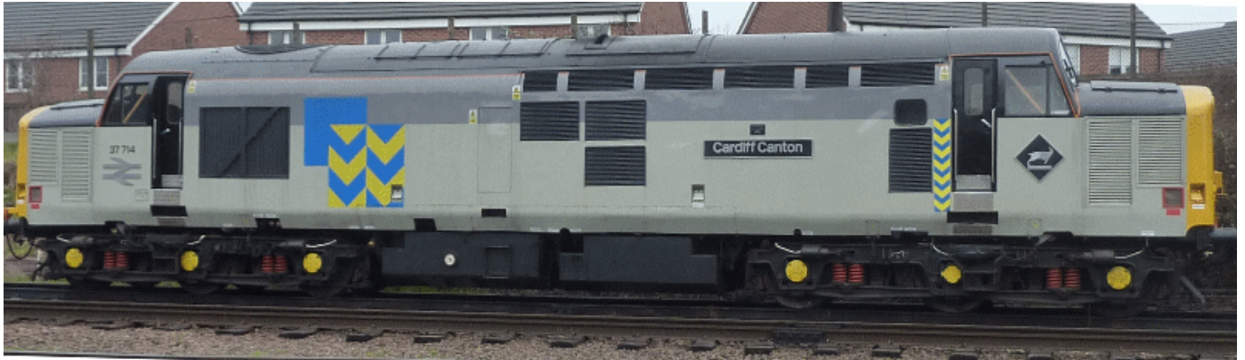
Class 37 no 37714 in the grey sector ITrainload Freight (Metals) livery.

The following photos are from Peter's visit to the Great Central Railway on 19th January this year.