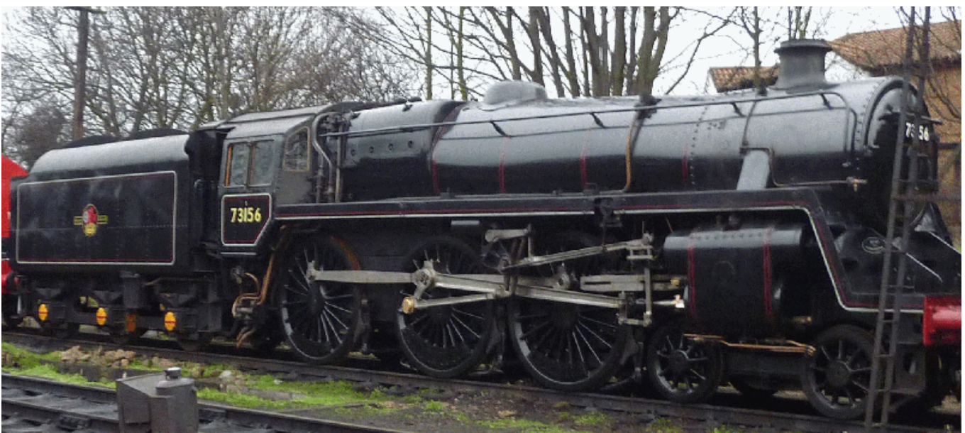
BR Standard class 5 no 73156