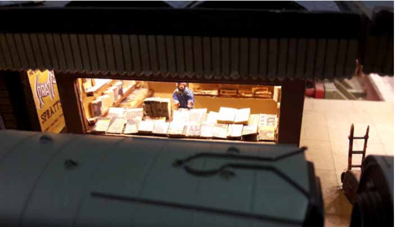
The illuminated book stall on the Club's Castle Station layout