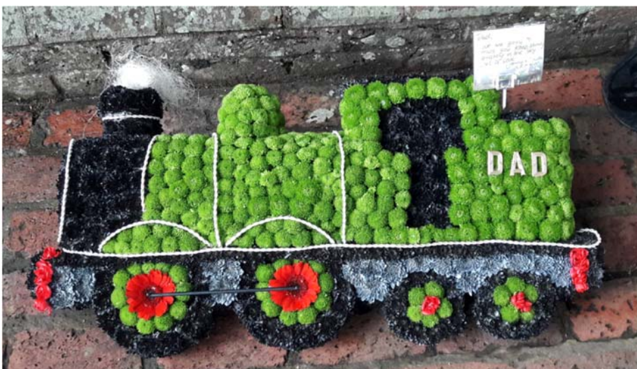
A very fitting floral tribute from Jim's daughters to their dad.